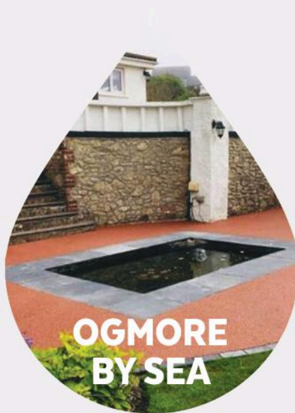
OGMORE BY SEA